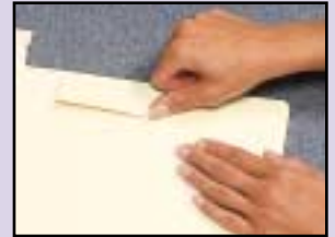
Fold on score lines to create reinforced panel.

ClickFile™ Software gives small offices and clinics the advantages of color coded shelf filing without the labor and cost of using labels. Plus, the ability to print on the entire folder gives you the opportunity to make your file folders more useful with printed forms, bar codes, and images.