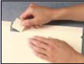
Remove and discard perforated excess.