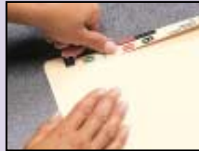
Fold on score lines to complete indexed tab.