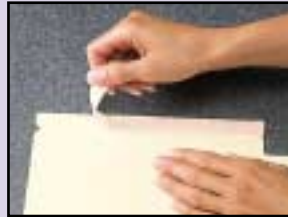
Peel off both tape backing strips.