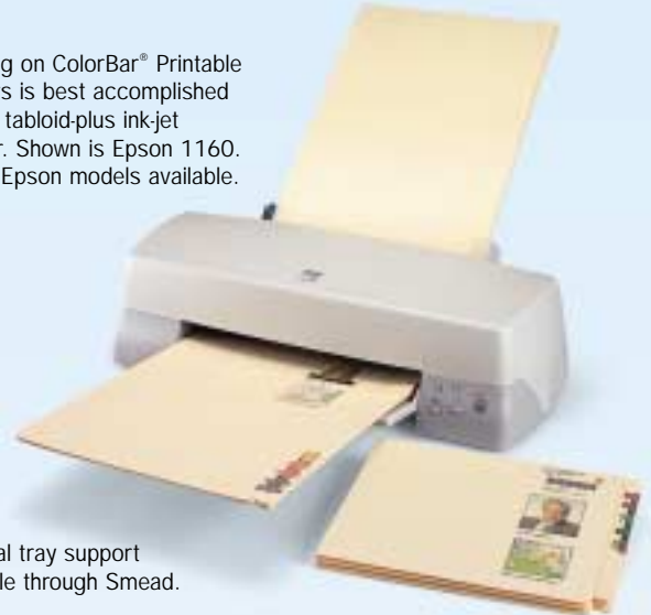
Optional tray support available through Smead.

Printing on ColorBar® Printable Folders is best accomplished with a tabloid-plus ink-jet printer. Shown is Epson 1160. Other Epson models available.